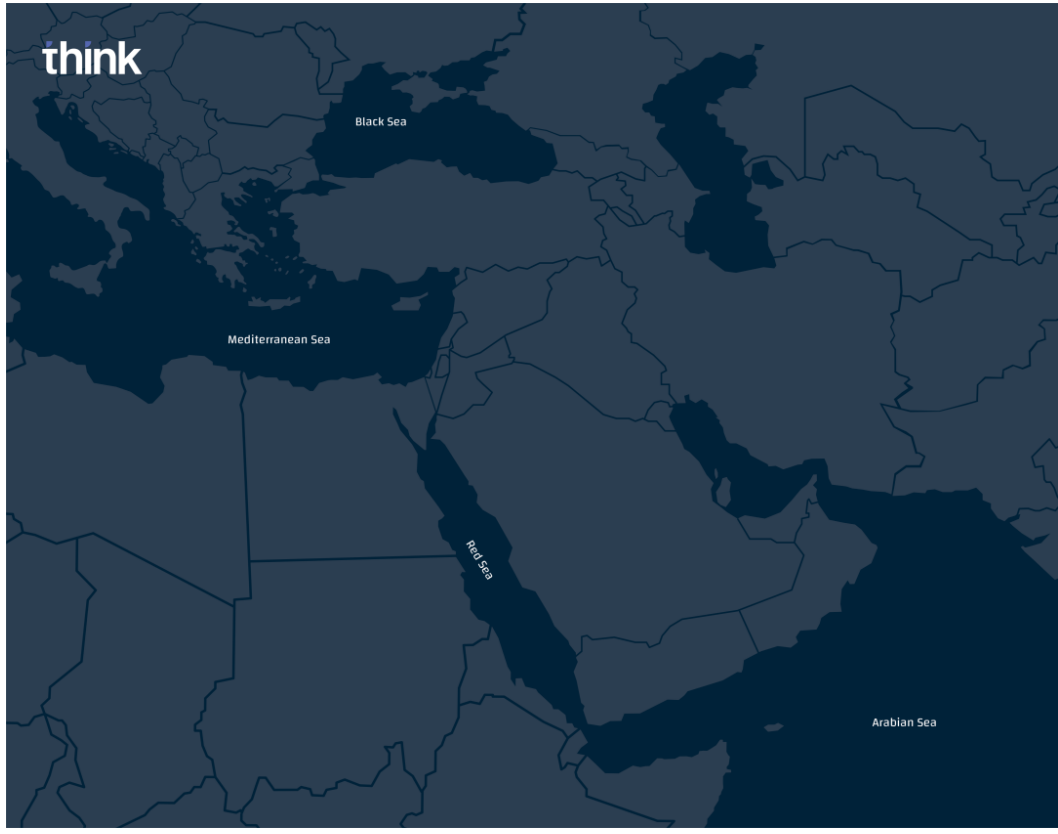
Impact of Russia's war in Ukraine on key trade routes in the region

Regional governments and businesses will continue to closely monitor the security situation in the Black Sea as they seek to protect grain supplies. They will closely watch whether the United Nations and others manage to secure a renewal of the grain passage deal by the Nov. 19 deadline. The pact's survival or demise may well serve as a litmus test on the viability of diplomatic efforts to avoid global hunger during a war.